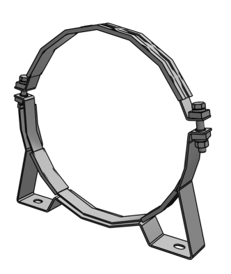
Interactive 3D graphic, click to activate and rotate. (3D capable PDF viewer required)

PART Number: 20127403625 CLAMP TYPE D368